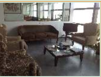
Lounge : Capacity upto 8