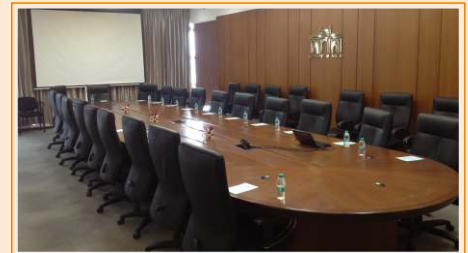
Conference Room: Capacity upto 40