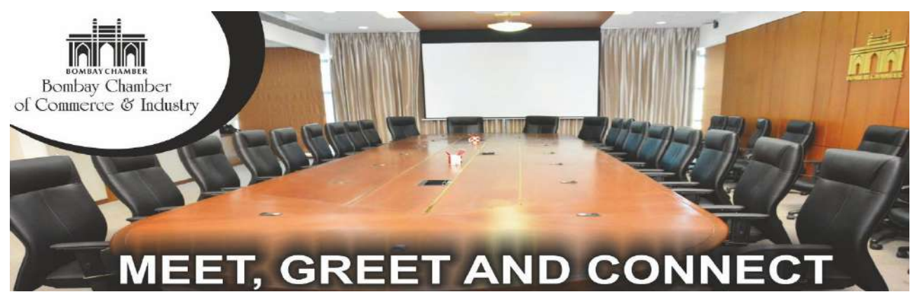
The right place for Conferences, Seminars, Arbitrations, Mediations and Board Meetings